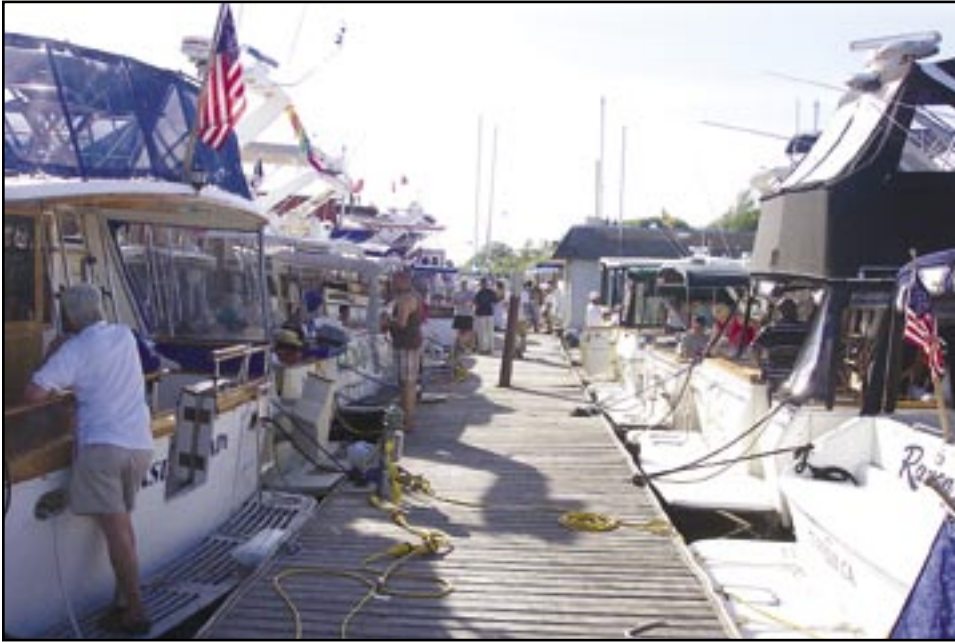
The dock party at EBC.

BBQ ribs, chicken and hot links with all the fixings. (And boy was it good!)