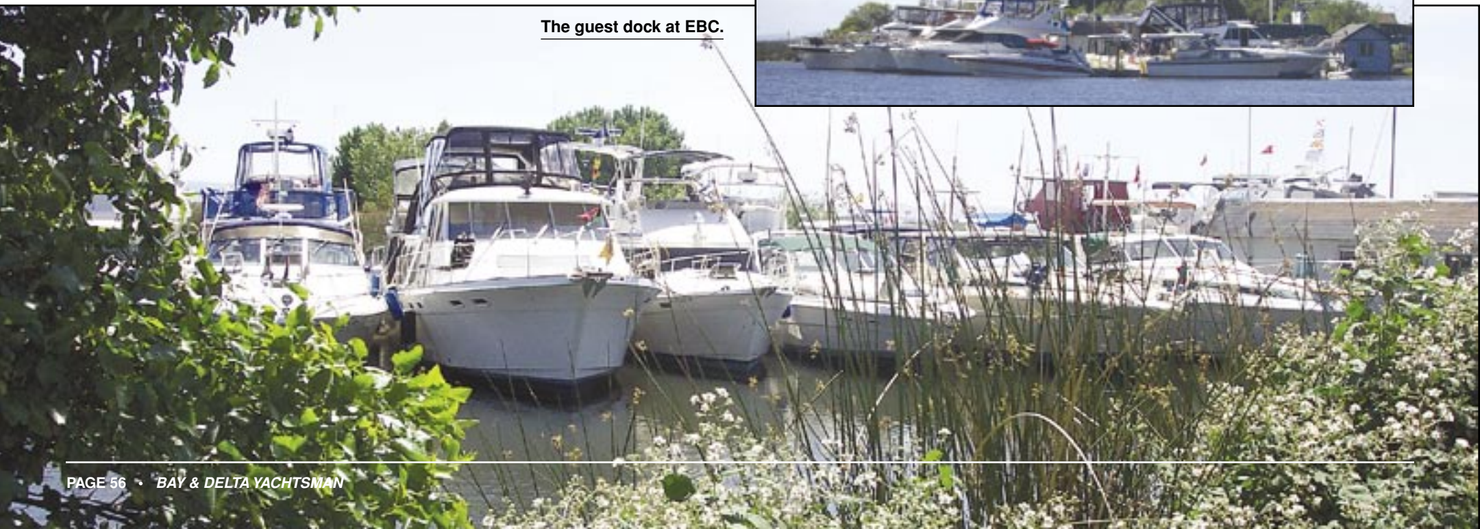
The guest dock at EBC.