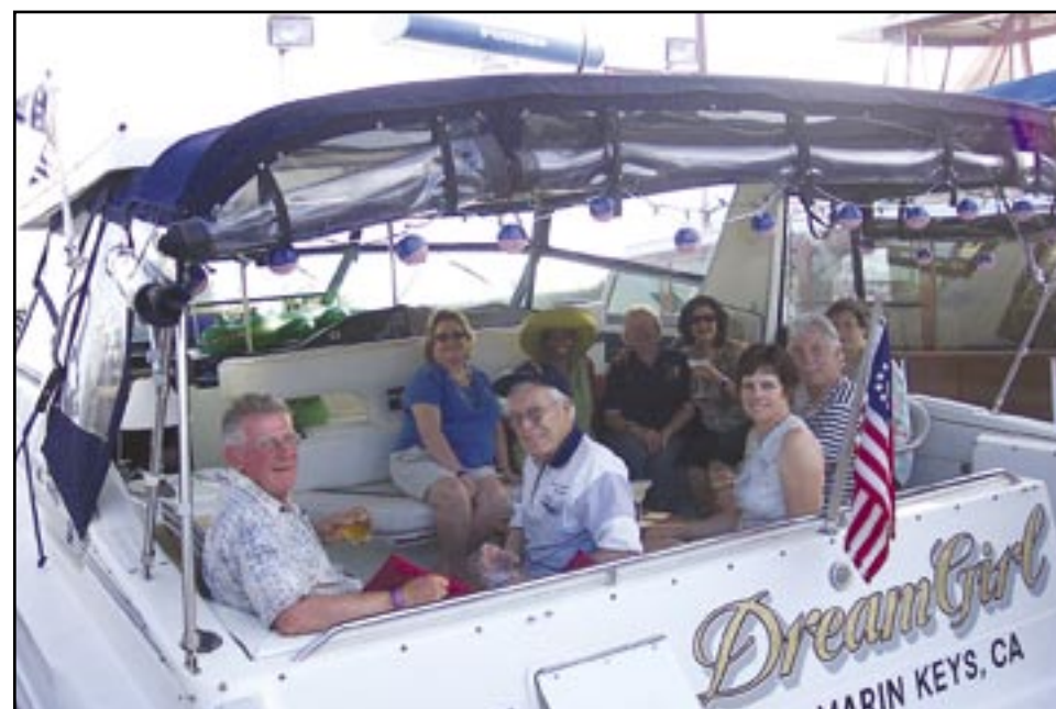
Cocktail hour at EBC's guest dock.

It was a beautiful day with light winds and plenty of sunshine and fresh air. The club presented an opulent (and long) table of appetizers for all.